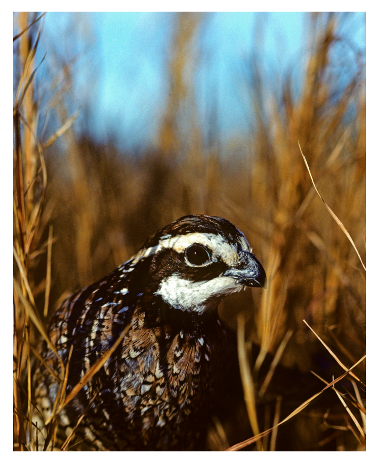
The northern bobwhite is one of many species that benefit from grazing operations with warm-season grasses that are native to the region.

One potential solution to this problem is to shift grazing cattle to warm-season grasses during summer. These heat- and drought-tolerant grasses grow well during summer and can address the summer slump with non-toxic forages. Incorporating these grasses into grazing systems can increase grazing days, reduce reliance on more costly hay and commodity feeds, and help improve all fescue pastures by allowing them to rest during summer.