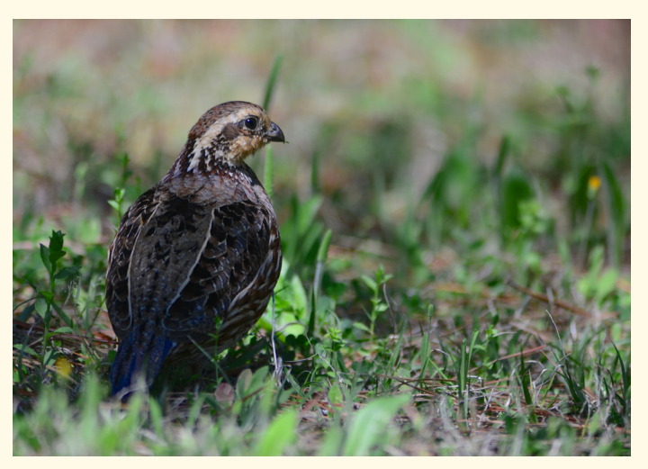
Grasslands provide much-needed habitat for northern bobwhite.

Across this region, the northern bobwhite quail (Colinus virginianus) population has been in steady decline (Sauer 2013). One major factor in the decline is the regional adoption of non-native forages like tall fescue, which provide poor cover and food resources. Adoption of native warmseason grasses could not only increase summer forage production, but benefit wildlife populations, particularly the northern bobwhite (Harper et al. 2015). These grasses are bunch grasses and this structure allows ground-nesting and foraging birds to move more efficiently than in bermudagrass and fescue. Furthermore, the greater heights at which native warm-season grasses are managed (i.e., 12-28 inches for natives vs. 3-8 inches for bermudagrass) provide protective cover for nesting, foraging, and brood rearing (Harper et al. 2015). Therefore, replacing non-native perennial