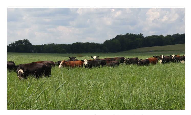
Native grass pastures, such as this switchgrass, provide good summer forage as well as suitable cover for species such as northern bobwhite.

Still, more science-based evidence about the benefits of native warm-season grasses is needed. Kurve et al. (2016) compared the carcass quality of steers that grazed bermudagrass and several native warm-season grasses in Mississippi. The study found no differences in the grade (choice or above), marbling score, carcass weight, and dressing