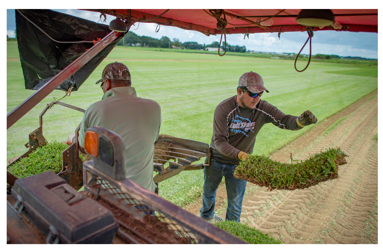
USDA is an equal opportunity provider, employer, and lender.

To learn more, visit farmers.gov/CFAP, contact our call center at 877-508-8364, or contact your local FSA office.