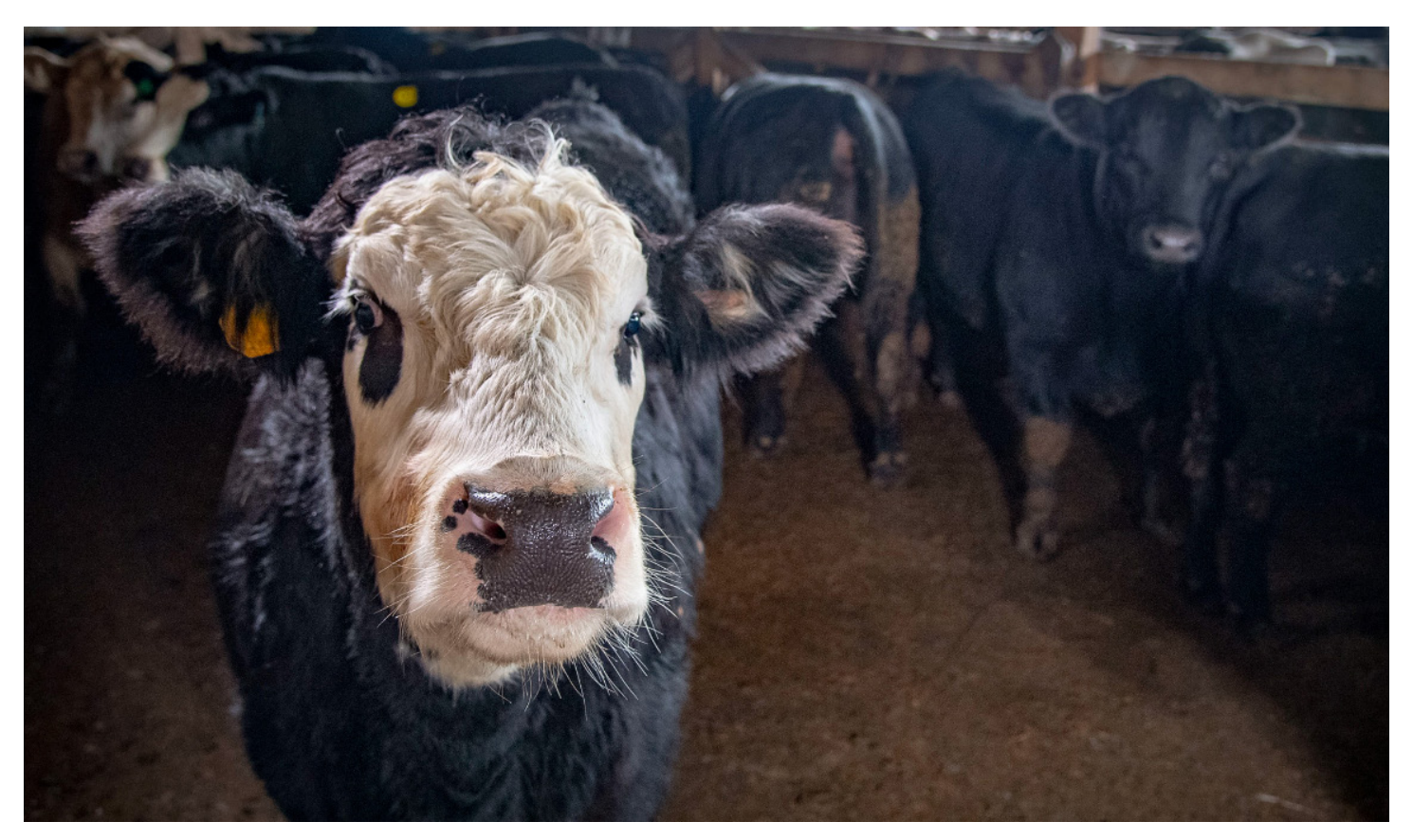
USDA is an equal opportunity provider, employer, and lender.

This is a separate program from CFAP 1. Producers who participated in CFAP 1 are encouraged to apply for CFAP 2 for additional assistance.