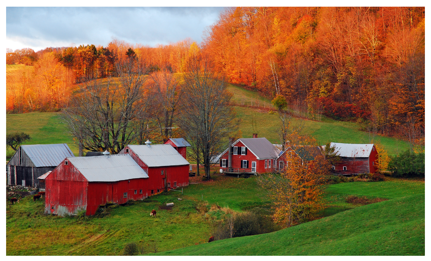
USDA is an equal opportunity provider, employer, and lender.

This is a separate program from CFAP 1. Producers who participated in CFAP 1 are encouraged to apply for CFAP 2 for additional assistance.