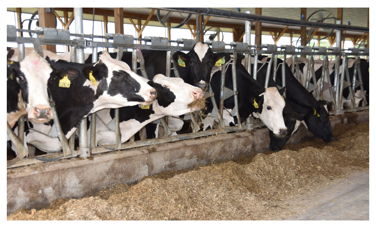
USDA is an equal opportunity provider, employer, and lender.

This is a separate program from CFAP 1. Producers who participated in CFAP 1 are encouraged to apply for CFAP 2 for additional assistance.