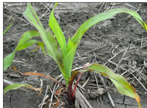
Phosphorus deficiency in corn.