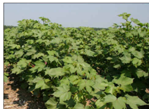
Sample depth for cropland is 6–8 inches.