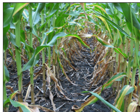
Soil tests help to identify production problems related to nutrient deficiencies or imbalances. Above: Nitrogen deficiency in corn.