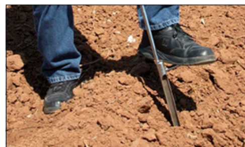
Soil sampling—Take 15–20 cores for one sample. Don't Guess—Soil Test.