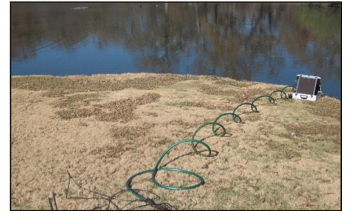
Farm ponds can be reliable sources of water for irrigation.

A well consists of a hole, with or without a supporting casing extending down into a water-bearing formation. Wells are dug, driven or drilled depending on the soils, rock and the depth to the water table. Wells usually require a permit.