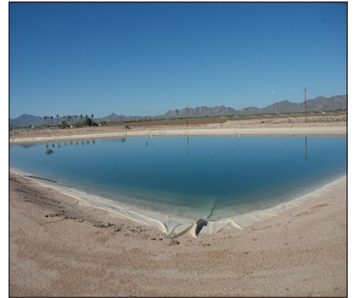
There are many sources of water