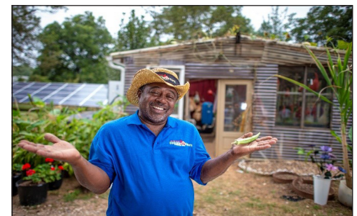
Contact a specialist from NRCS for more assistance