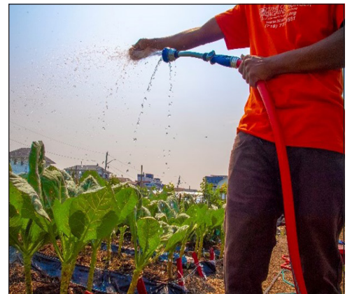
A clean reliable water source is important for your irrigation system