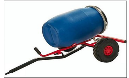
Water tank trailer

Rain barrels can be an inexpensive way to collect water for irrigation. Since the amount of water available is small and dependability is low, it is best suited for a small garden next to the house.