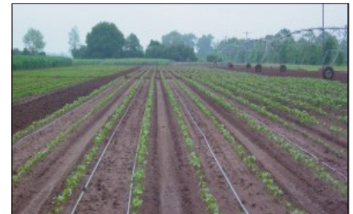
Typical drip irrigation system